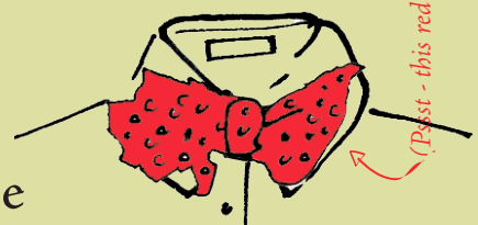
(Psst - this red bow tie is a map of Cambridge!)

Ever notice that the city of Cambridge is shaped like a bow tie?